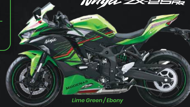
Lime Green / Ebony

* Specifications are subject to change without prior notice