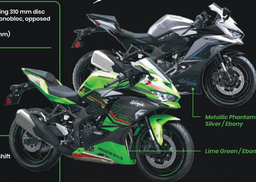
Metallic Phantom Silver / Ebony